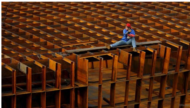
China's shipbuilders have jostled for supremacy with South Korea but its dockyards suffer from the overcapacity seen in many sectors

Overcapacity fuelled by subsidies threatens the world's second-biggest economy