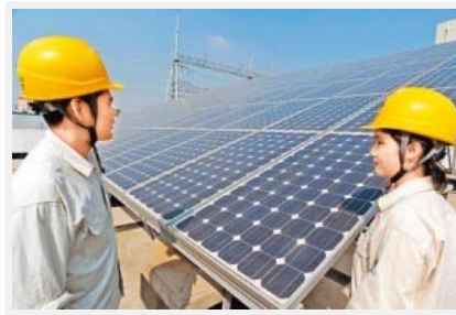
Angela Merkel says she wants to avoid China-E.U. solar panel dispute, but her home grown solar industry won't be too happy about that.

Chinese trade officials will meet with the European Commission on Monday to discuss ways in which the two trading partners can avoid a worsening anti-dumping dispute regarding Made in China solar panels. A vote by Commission is scheduled next month.